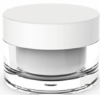
STANDARD CAP CSCY50-U