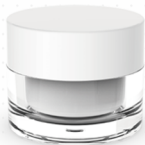
EXTENDED CAP CSCY50-HU