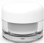
ROUNDED CAP CSCY50-GU